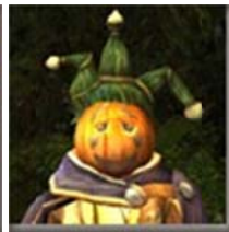
Hobbit Pumpkin Mask