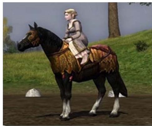
Sable Harvestmath Horse ( NEW )