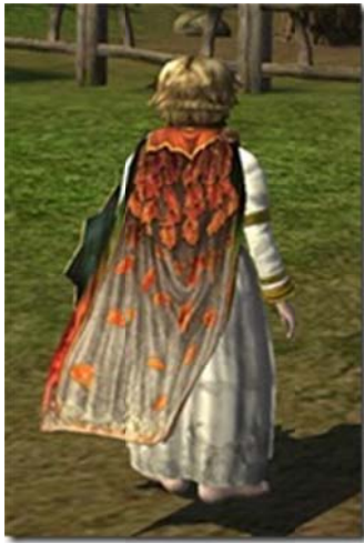
Cloak of the Falling Leaves 12 Tokens