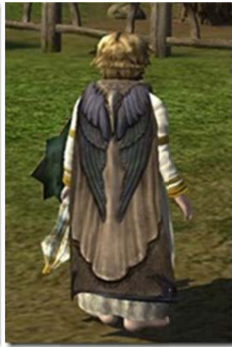
Cloak of the Raven 12 Tokens