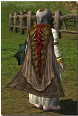
Cloak of the Boar 12 Tokens