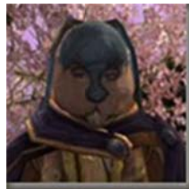
Elf Rabbit Mask