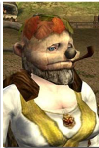
Pipe Festival Mask 12 Tokens