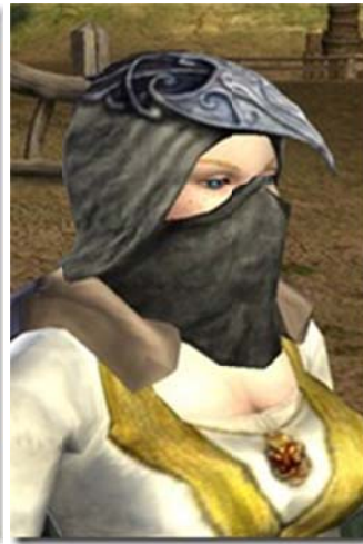
Raven Festival Mask 12 Tokens