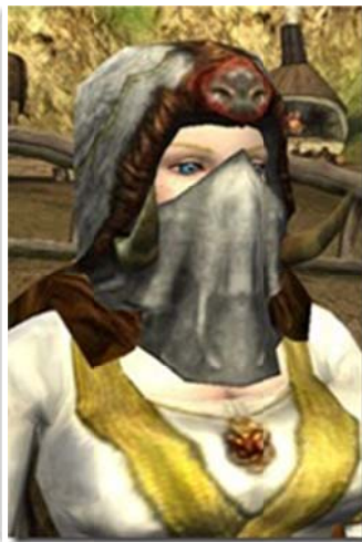
Boar-Head Festival Mask 12 Tokens