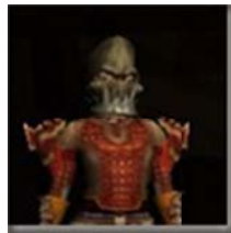
Dwarf Bucket-head Mask