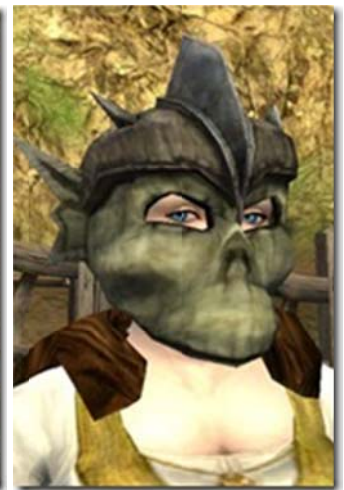
Goblin Festival Mask 12 Tokens